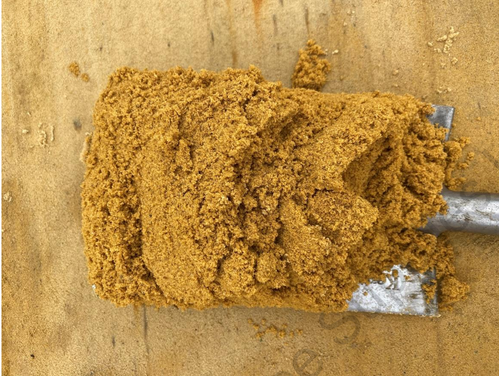
Plate 1: Bury Hill Kent Medium / Coarse Subsoil Sample