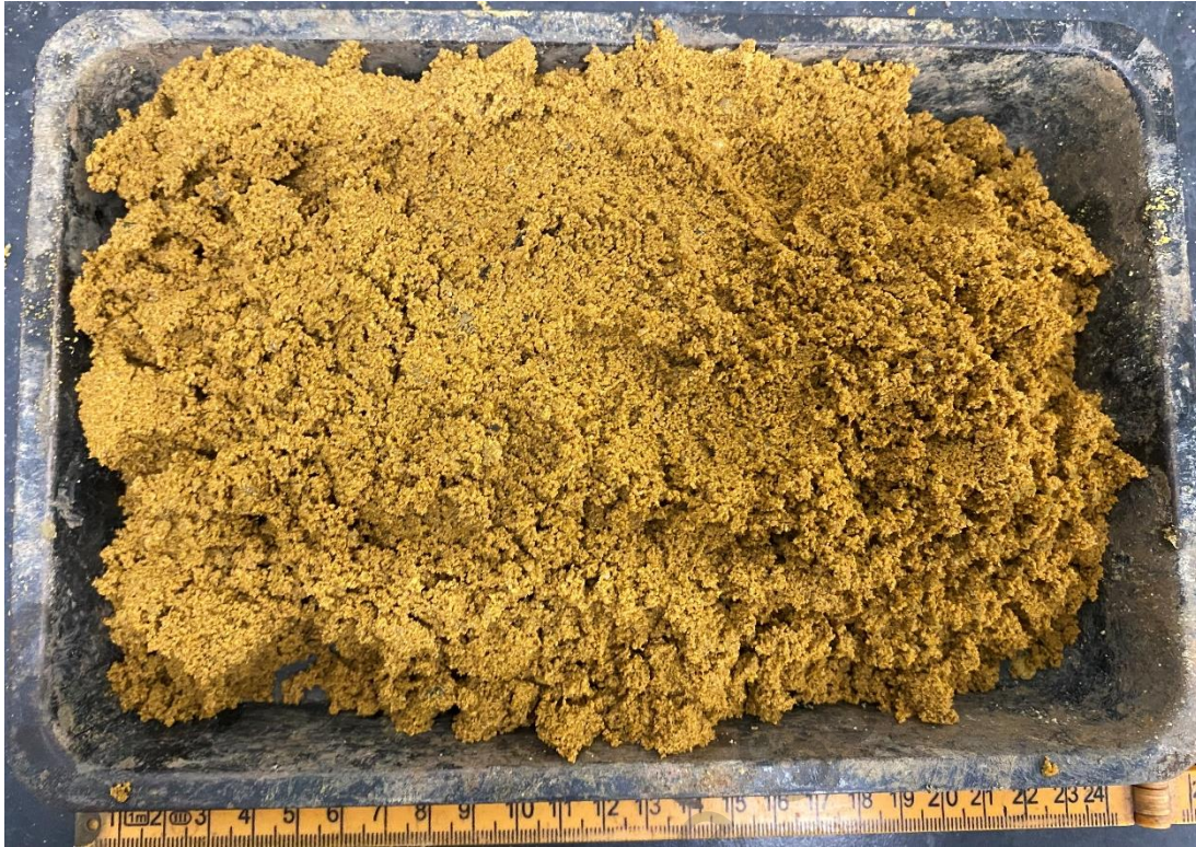
Plate 1: Kent Medium Contract Sand Sample