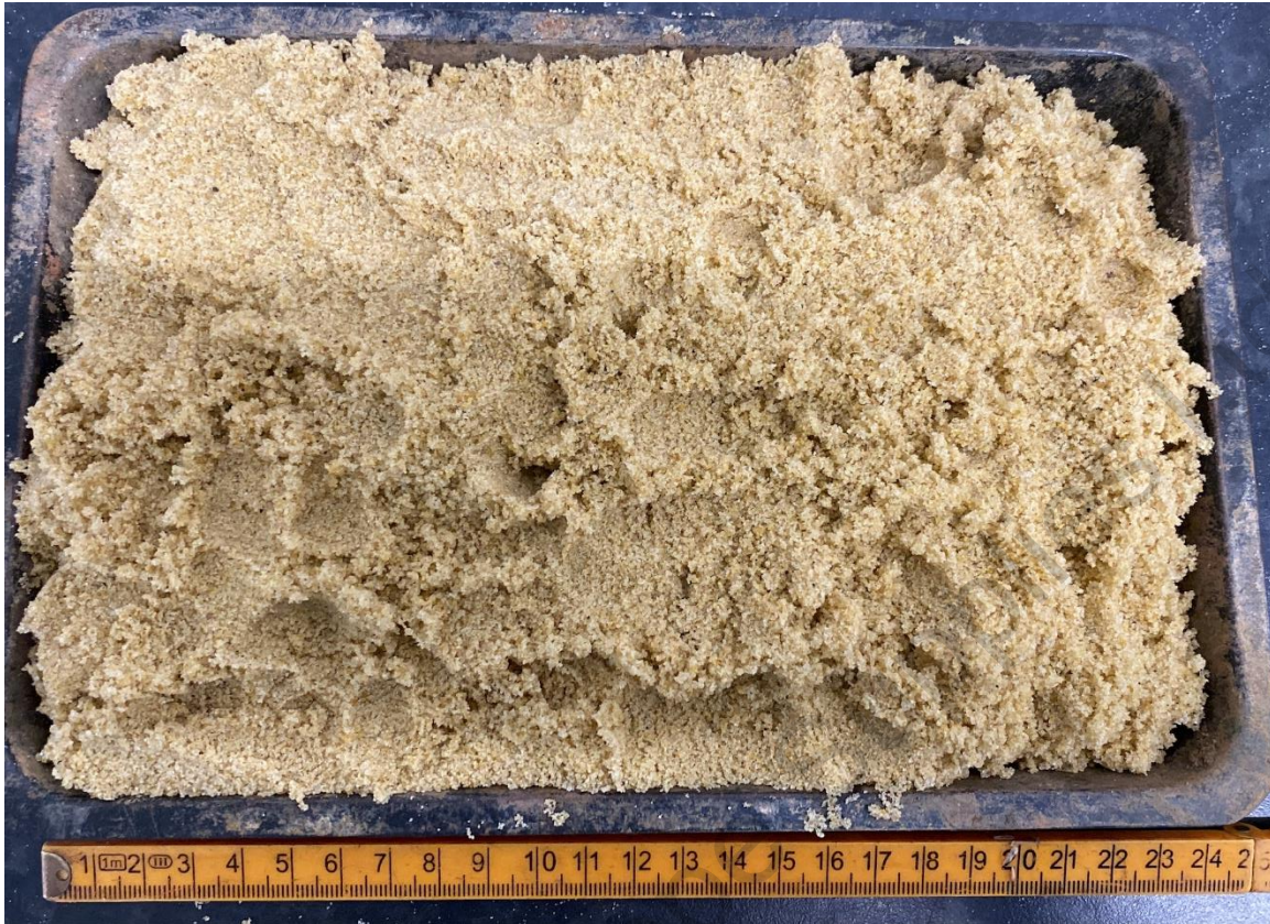
Plate 1: Washed Tree Pit Subsoil (R) Sample