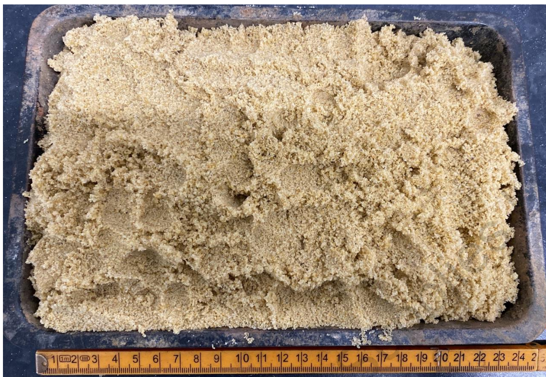
Plate 1: Jump Pit Sand Sample